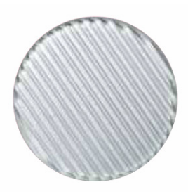
Linear Spread Lens