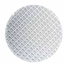
Heavy Spread Lens