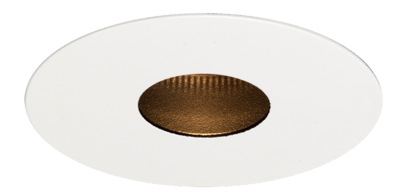
92mm (3.62") overall diameter. Available with standard trim kit or plaster-in kit for flush appearance. Family of matching products also available. Required depth height + 25mm^