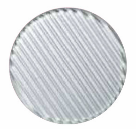
Linear Spread Lens