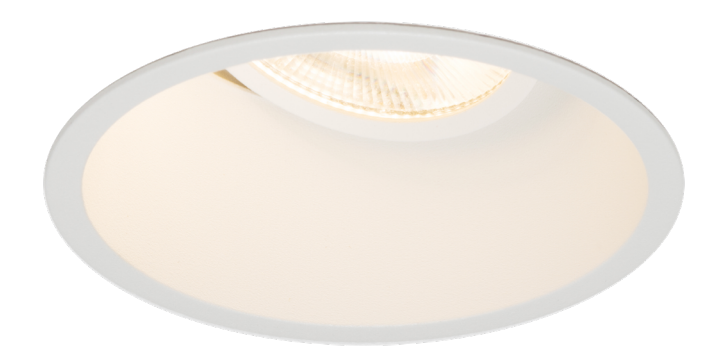
86mm (3.39") overall diameter. Up to 25° tilt. Range of soft appearance with minimal trim for achieving trimless effect. Family of matching products also available. Required depth height + 25mm^