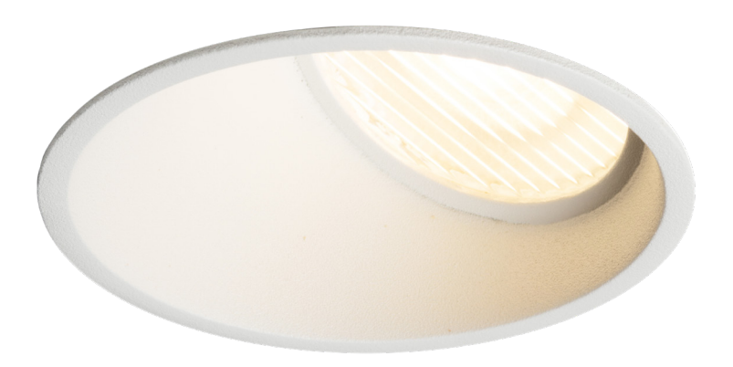
86mm (3.39") overall diameter. Range of soft appearance with minimal trim for achieving trimless effect. Family of matching products also available. Required depth height + 25mm^