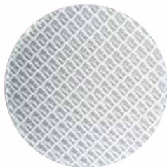
Heavy Spread Lens