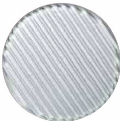
Linear Spread Lens